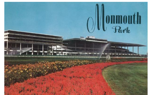
Flowers supplied to Monmouth Park Racetrack by Foggia's Florist